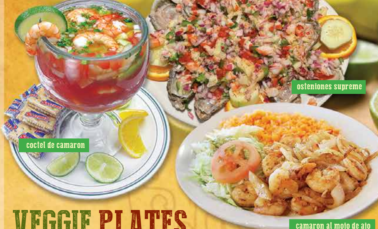
coctel de camaron

Ask your server about menu items that are cooked to order. *Consuming raw or undercooked meats, poultry, seafood, shellfish or eggs may increase your risk of foodborne illness. Please advise your server if you have food allergies