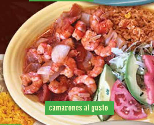
camarones al gusto