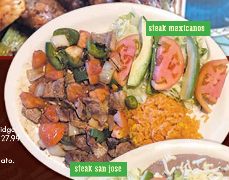
steak san jose

Please advise your server if you have food allergies