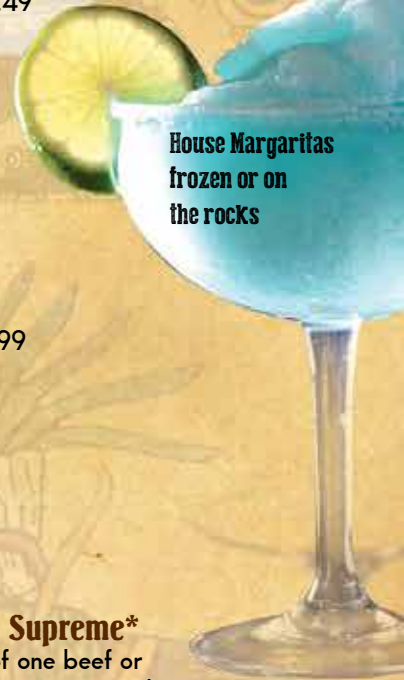
House Margaritas frozen or on the rocks