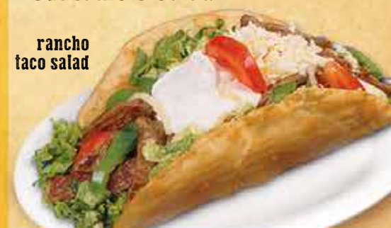
rancho taco salad