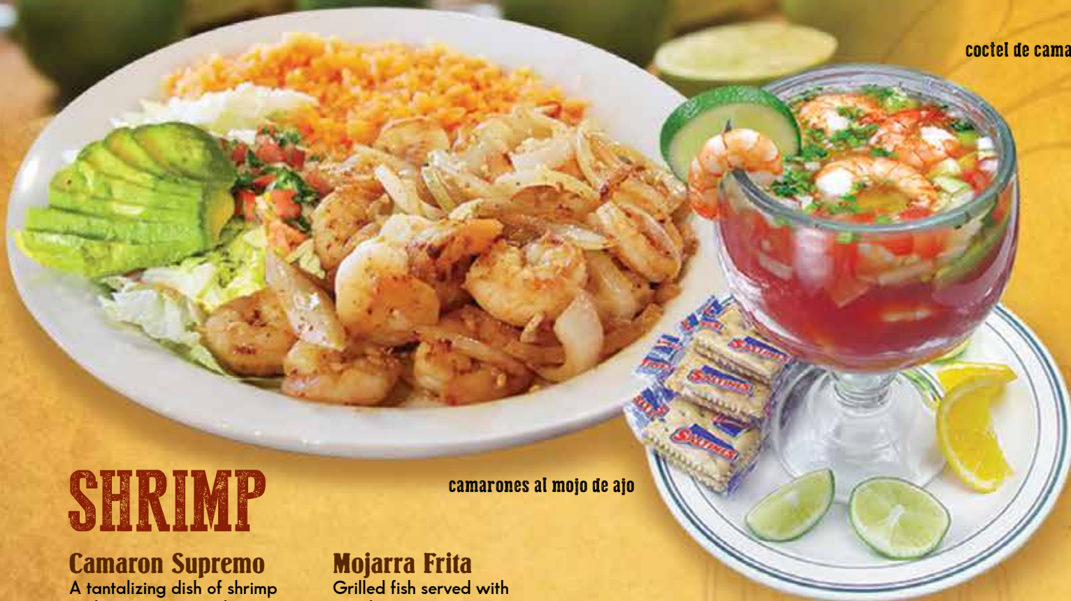
coctel de camaron