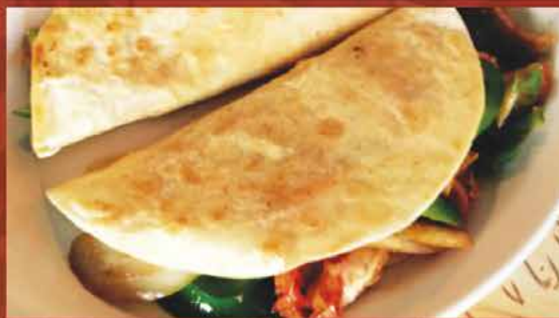
quesadilla de fajitas